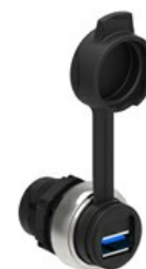
USB interface, A/B female type connection LPCD0